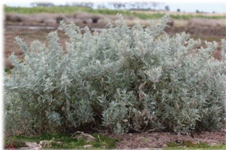
Flora study: Saltbush

2024 CWA OAKLANDS CELEBRATING 75 FABULOUS YEARS