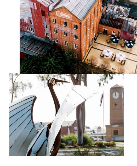
Whisky and chocolate in a converted flour mill, and sculptures to discover across our region.

Our people are a product of this place. A place that has created vibrant, diverse and creative communities. We are proud of our past, our work and our people. We invite you to come and share more.