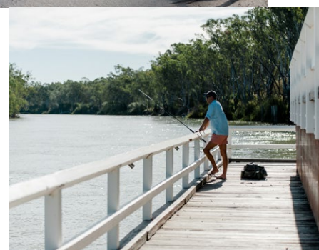
Cast a line and relax by one of our pristine rivers or lakes.